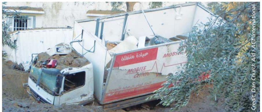
Four health clinics, supported by act for peace partners were destroyed by Israeli air strikes.

"Every moment for 24 hours of each day during the war was a challenge for us. Thank God we could do something. But it was a real massacre in Gaza. Our homes were not safe, the hospital was not safe, the schools were not safe and the streets were