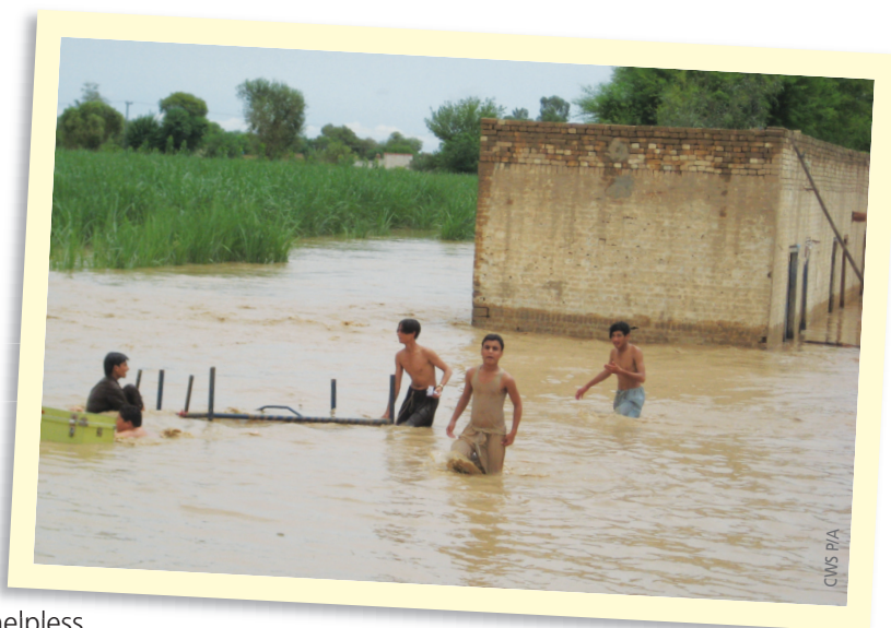
Pakistani Flood Victims