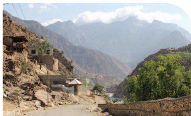
Kohistan's rugged terrain